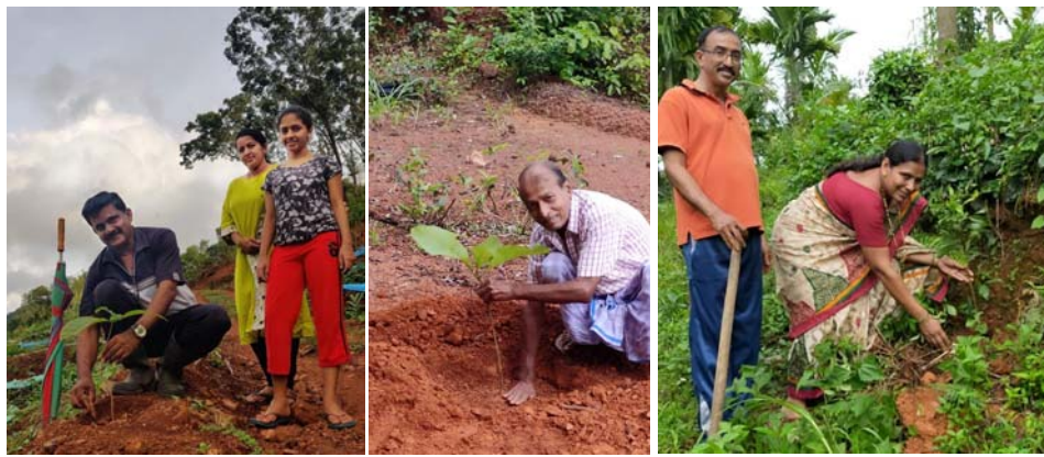
ರೋಟರಿಯ ಗಿಡ ನೆಡುವ ಯೋಜನೆ